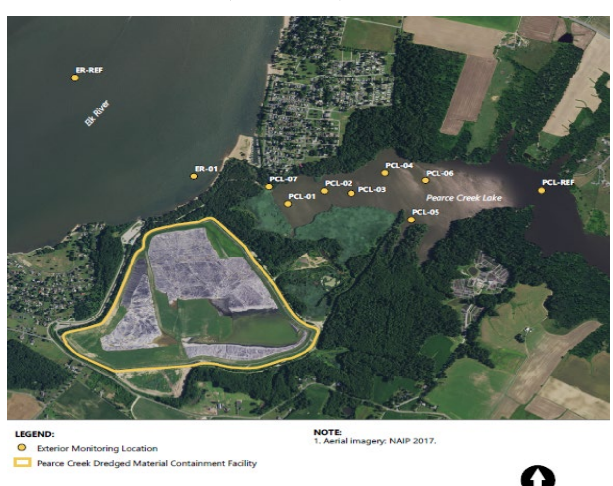
FIGURE 1. EXTERIOR MONITORING LOCATIONS

This monitoring event is the seventh post-placement monitoring event since dredged material placement began in late 2017 at the Pearce Creek DMCF. Monitoring results indicated that water discharge from the Pearce Creek DMCF have not had an adverse effect on the aquatic environment in Pearce Creek Lake. The frequency of exterior monitoring events beyond those planned through the fall of 2022 will be determined through adaptive management.